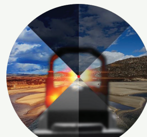
10 | 9 | 8 | 7 | 6 | 5 | 4 | 3 | 2 | 1 | 0

Dual Illumination: With 10 BRIGHTNESS LEVELS for day and night use, the clear and bright reticle performs so well that you rarely need to set it to the highest level, even in daylight.